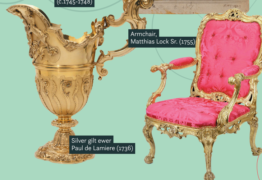
Silver gilt ewer, Paul de Lamiere (1736)