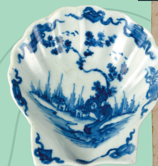
Shell shaped pickle tray, Limehouse Porcelain Factory (c.1745–1748)